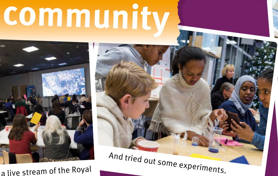
Our Maker Challenge participants presented some incredible prototypes.