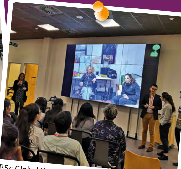
BSc Global Health students shared insights about their placements with local community groups.