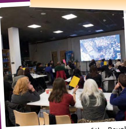
We joined a live stream of the Royal Institution's Christmas Lecture.